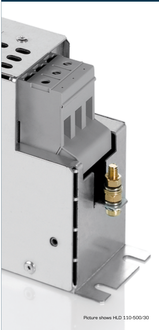
Picture shows HLD 110-500/30